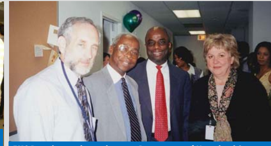
FMS President with our clients at Department of Homeland Security (legacy U.S. Immigration and Naturalization Service)