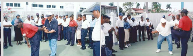
U.S.-Law Enforcement Experts providing security training to FMS Guard Force in Guyana