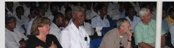
FMS Consultants seated with FMS Attorney (During a visit to review the company's operations in Guyana and provide Management training)