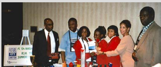
FMS has a long history of supporting education initiatives in the District of Columbia (Sponsorship of DC Public School Students' Future City Competition)