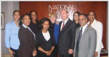
National Cancer Institute