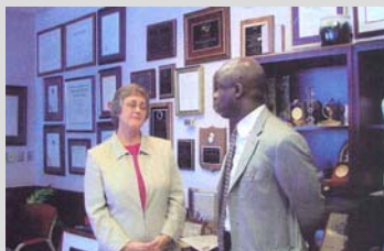
National Science Foundation