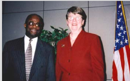
U.S. Department of Justice, Attorney General's Clean Audit Award FMS Staff, Teaming Partners, and DOJ Professional Staff at U.S. Immigration and Naturalization