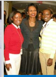
FMS DOS Staff with then Secretary of State Condoleezza Rice