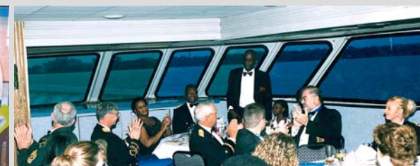
FMS Sponsorship of an event to honor returning wounded Iraq War veterans