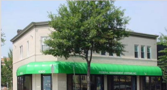
Previous FMS Headquarters on Georgia Avenue, NW