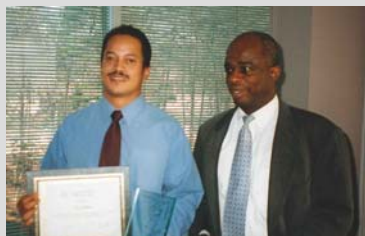
Special Award and Recognition at the National Institutes of Health for Exceptional Performance