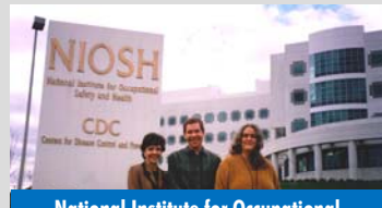
National Institute for Occupational Safety and Health